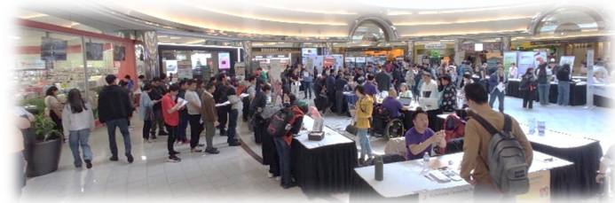
Spotlight on SIL job seeker at the job fair

for the businesses within the mall and surrounding community. The general public including RCD members and job seekers with disabilities currently enrolled in the Centre's employment project Supports for Independent Living (SIL), were invited to attend. A total of 20 businesses and organizations met in the kiosk area of the mall from 12 to 5 PM on Saturday, August 24, 2024. Over 130 people stopped by the RCD table with many signing up to volunteer. Up to 71 stopped by to learn about the Supports for Independent Living Project (SIL) with 7 people with disabilities indicating interest in the project's job seeking assistance, and 44 people completed surveys at the Event & Accessibility table.